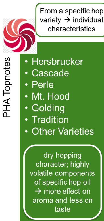
Figure 1: PHA® Topnotes

PHA® Topnotes products are a hop extract in an aqueous propylene glycol carrier, produced by a proprietary physical separation process. It is considered as GRAS (FEMA no. 2580 - Hops, oil). Propylene glycol is registered as a food additive according to Annex II of EU Reg 1333/2008 as well as E1520 and PG is a permitted carrier for flavors as per regulation 2006/52/EC. PHA® products are exclusively supplied worldwide by BarthHaas.